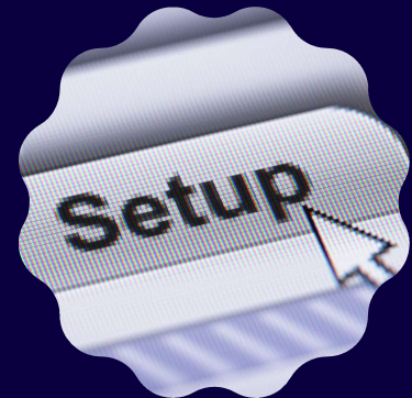
Social Media Setup Tips